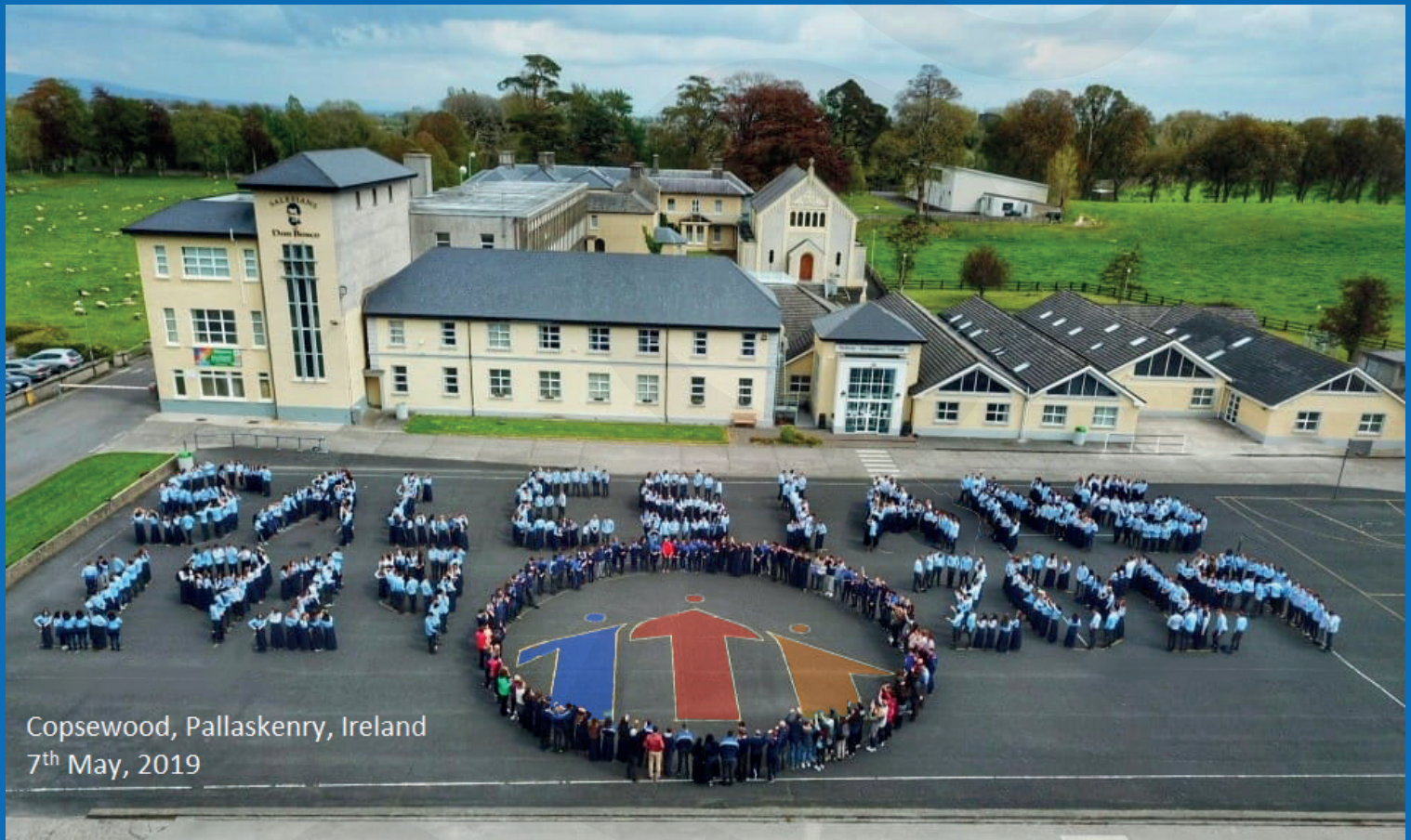
Copsewood, Pallaskenry, Ireland 7 th May, 2019

The college operates an open door policy where a parent can make an appointment to meet with a Year Head at any stage if they have concerns. The Principal and Deputy Principal are also available to meet with parents should the need arise. We focus on partnership with the parents and believe that a co-operative relationship between the college and home best fosters the development of the student.